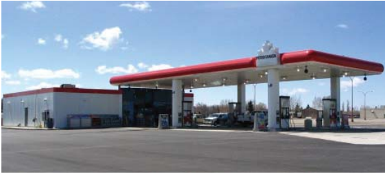
Kahkewistahaw Gas and Convenience Store

Before the service station opened, the 17 new hires attended a seven-week program at the College where they benchmarked their Essential Skills with a TOWES (Test of Workplace Essential Skills) assessment.