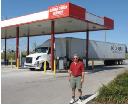
Elmira Truck Services Limited

Skills is very impressive and Elmira participants quickly realized that this was an opportunity that they needed to take advantage of.